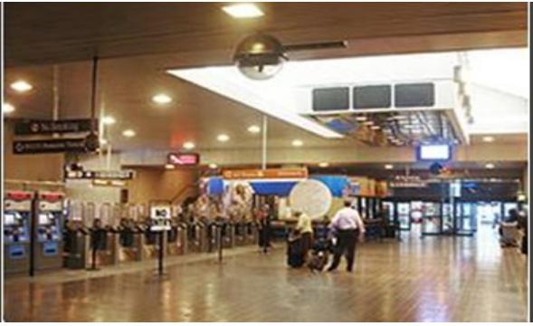
Hartsfield –Jackson International Airport Atlanta, GA 30314

MARTA's Transit Oriented Development Guidelines classify Airport transit station as a "Special Regional Destination" station. This classification system reflects both a station's location and its primary function.